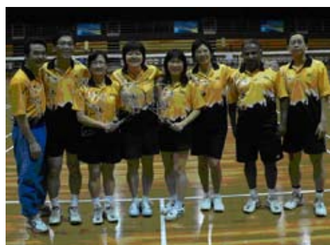
The Monash Badminton Masters