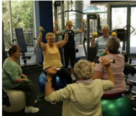
Older Adults program at Peninsula capmus

See our Facebook page for more photos or visit: www.sport.monash.edu/news/photo-gallery