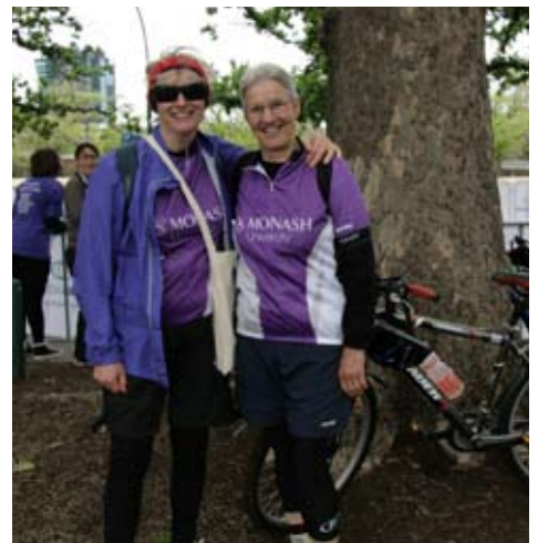
Enjoying the Around the Bay in a Day event