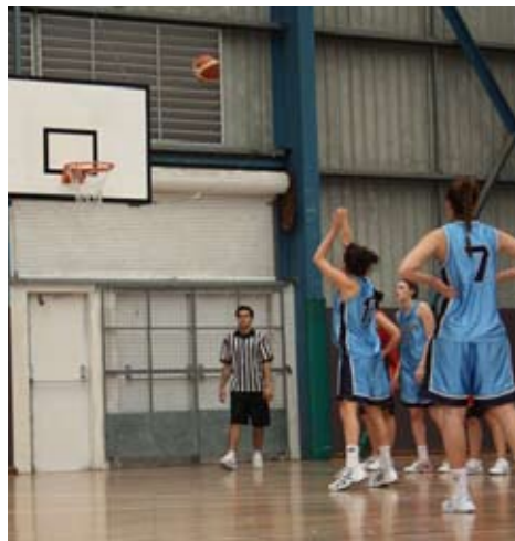
Women's basketball at AUG 2009